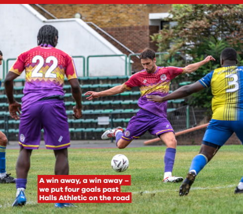
A win away, a win away – we put four goals past Halls Athletic on the road

0-3 at home to Harwich & Parkeston in the ESC