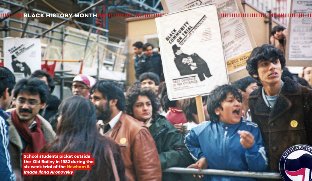
School students picket outside the Old Bailey in 1982 during the six week trial of the Newham 8 .